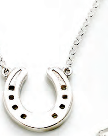
Above and right The classic horseshoe necklace and classic snaffle necklace by Hiho Silver