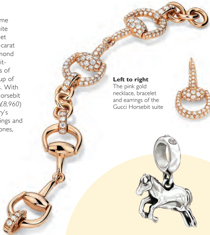
Left to right The pink gold necklace, bracelet and earrings of the Gucci Horsebit suite